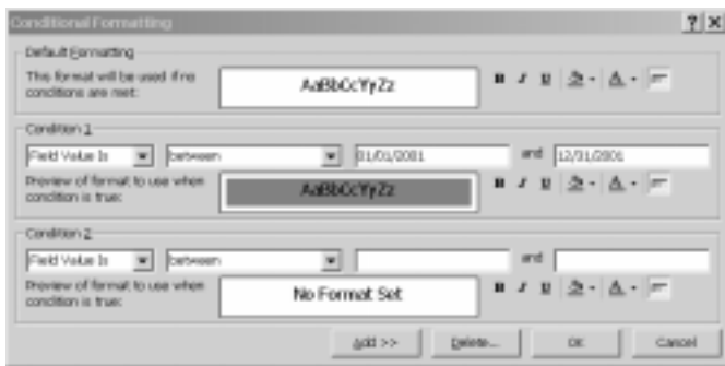
Figure 1. The Conditional Formatting dialog.